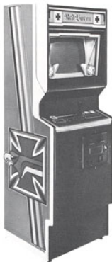
ATARI's Red Baron, the super-realistic first person flying simulation game, is now being offered