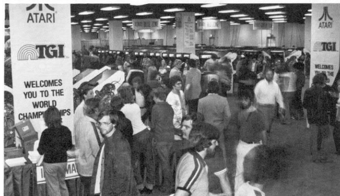
A bustling crowd gathers at the entrance to the ATARI World Championships for video games.