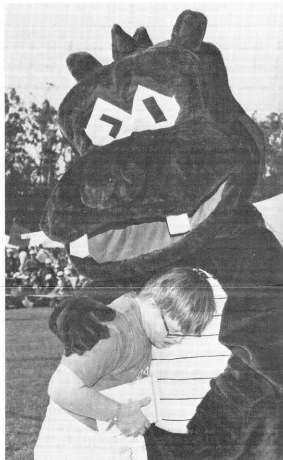
Fygar congratulates a happy but exhausted Special Olympian.