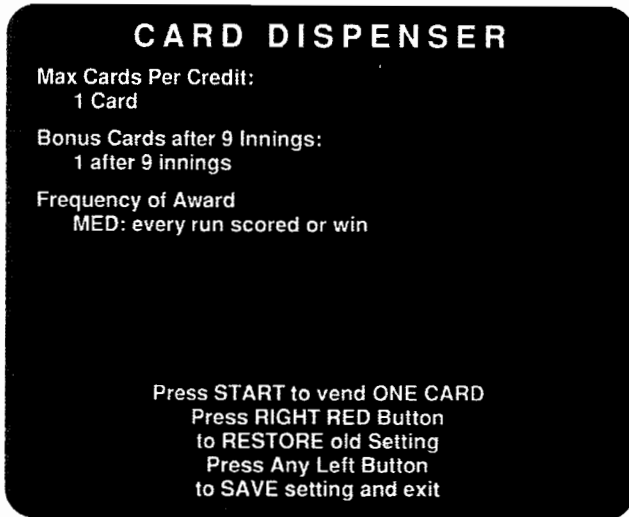
Figure 1 Card Dispenser Options Screen